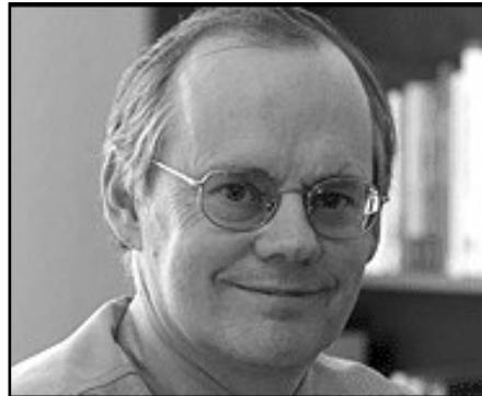
VC Cleary plotting redundancies

closed down for rebuilding – presumably not worthy of a mention as it is not an academic department.